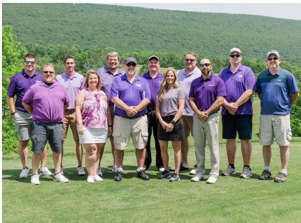
Special "Thank You" to S.P.M. Employees and M.P.S. Employees for their support

The Griffith Family Foundation P.O. Box 28 Hollidaysburg, PA 16648