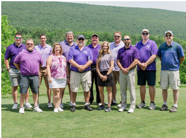
Special "Thank You" to S.P. McCarl & Company and McCarl's Preferred Services for their support

The Griffith Family Foundation P.O. Box 28 Hollidaysburg, PA 16648